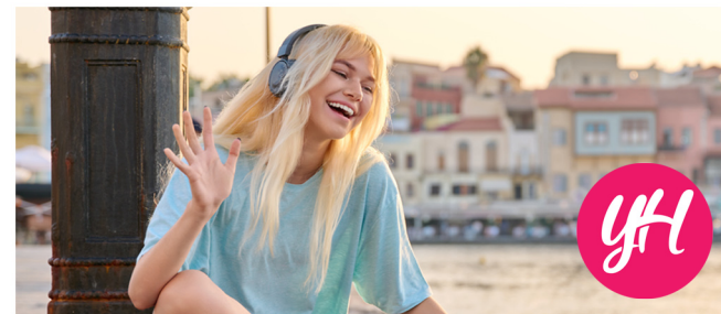
Pink & White Circle Logo on an image background