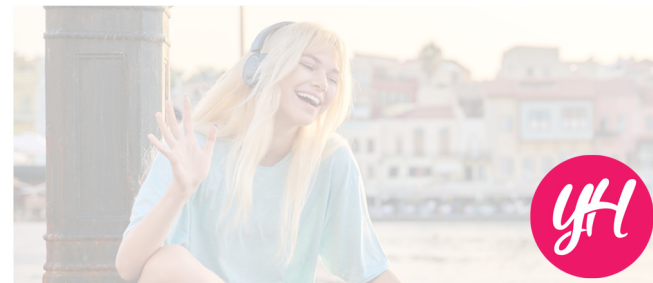
Pink & White Circle Logo on a light background